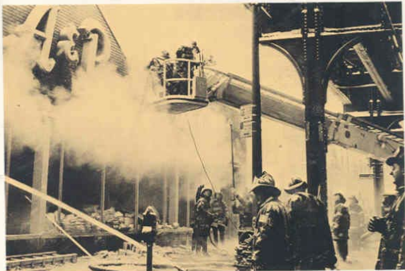
Fire scene photographs above illustrate the versatility of Aerialscope. In the one-story building, the fire is being fought from under the elevated-train structure. To reach the fire on the sixth floor of an apartment building, Aerialscope is working from an alley.