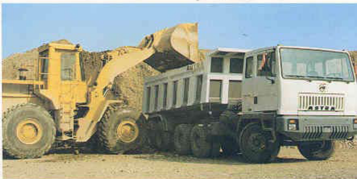
ASTRA BM 305 tractor at work in a quarry.

fifth atic sy- draulic can be ed to rillers, signed l wor- W. of ors and many ducing quired enance