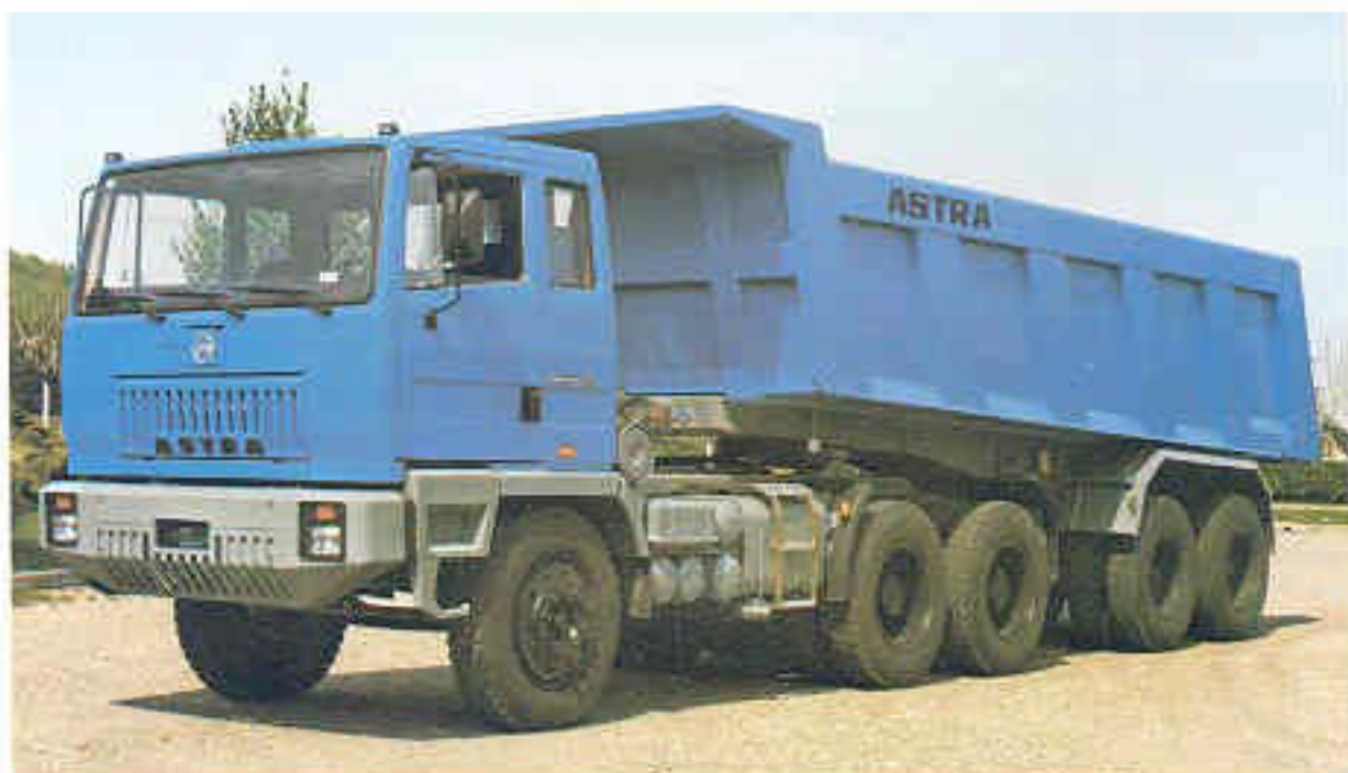
ASTRA BM 305 tractor with ASTRA ASR rear tipping semi-trailer.