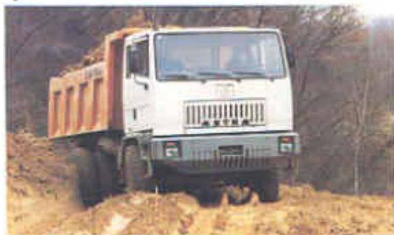
On fleets and off-road tests.