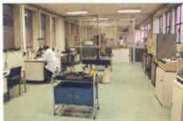
The chemical and engineering analysis lab.

Only extended and severe practical tests can make it possible to perfect a mechanical structure in every detail, until the version which prefigures the production model is reached. At ASTRA , this stage has assumed particular importance: in the preliminary tests, the vehicle not only has to overcome national and E.E.C. standards for quarry and job-site vehicles, but must also bear in mind the very strict requirements posed by the larger construction companies and the Armed Forces. For this reason, each vehicle is tested under extremely severe conditions, involving stress tests under "off-road" conditions which correspond to years and years of normal operational use. Complex electronic equipment makes it possible - during these tests - to measure stresses and deformations in order to improve each single component. Once this experimental stage has been completed, the checks continue even during normal production routines: all material and each single component used in producing ASTRA vehicles are, in fact, carefully checked, in order to maintain the established quality levels. At the end of the assembly line, all vehicles then undergo a first test track in order to check the functionality of the various mechanical elements and relative control units. Lastly, a concluding test is performed - on off-road tracks - which makes it possible to discover any faults before proceeding to the final "set-up" which is carried out before the vehicle is delivered.