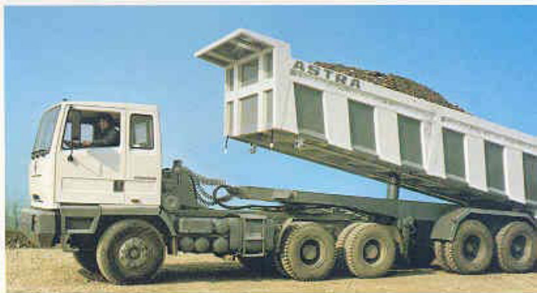
ASTRA BM 309 tractor with ASTRA ASR 701T three-way tipping semi-trailer.