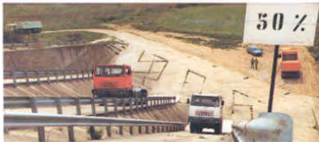
Gradient capability tests.